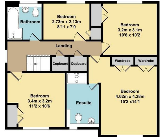
First Floor Approx. Floor Area 65.91 Sq.M. (709 Sq.Ft.)